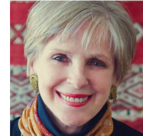
Jane Bryant Quinn Journalist