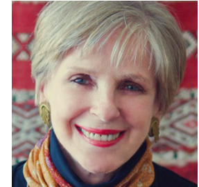
Jane Bryant Quinn Journalist