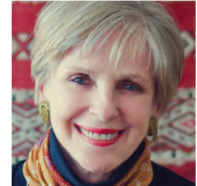
Jane Bryant Quinn